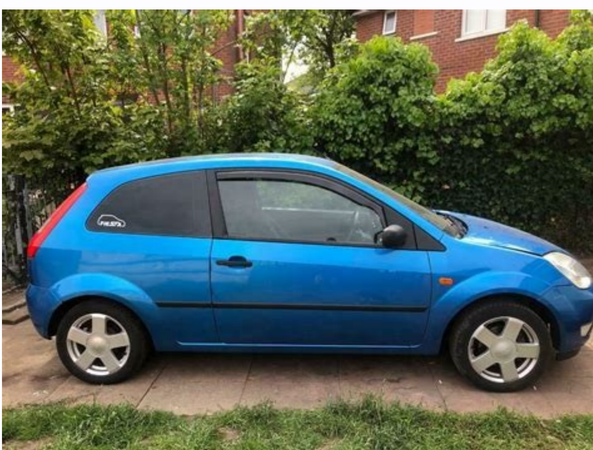
Ford fiesta 1.4 16v zetec 1998. Ford fiesta motor zetec 1.4 16v.